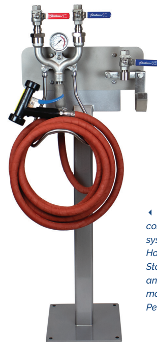
Shown here as a complete washdown system with an M-750TG Hot & Cold Water Hose Station, Premium Hose, and an M-70 Spray Nozzle mounted on the Duo Mod Pedestal Stand